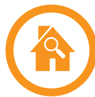
Real Estate Representation