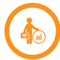
Design, Fitout & Project Management