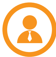
HR Support Services