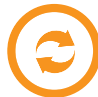
Government Annual Renewals